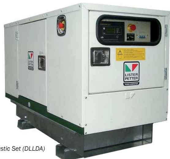
Acoustic Set (DLLDA)