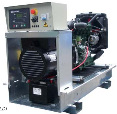
Open Set (DLLD)